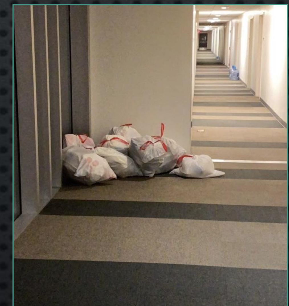
This is an image of trash found in a dorm hallway in one of ASU's freshman dorm building.