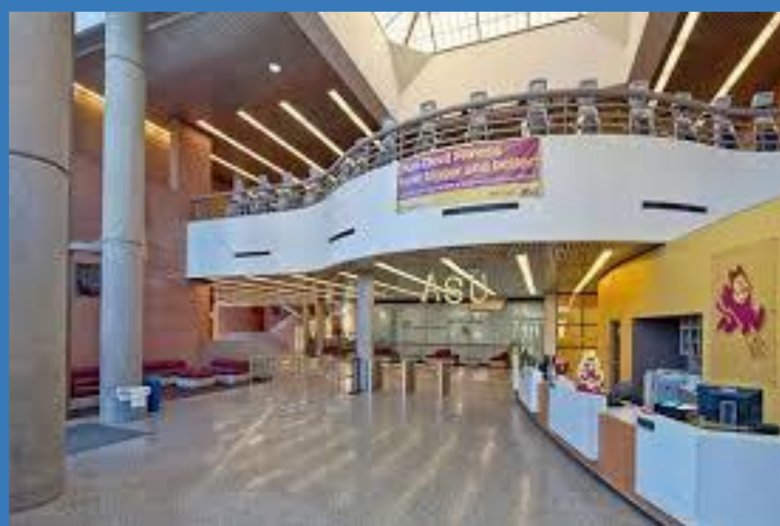
Sun Devil Fitness Center